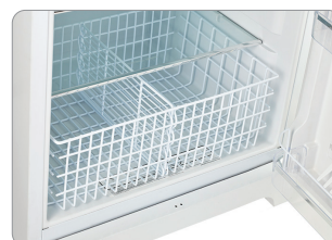
Large wire crisper