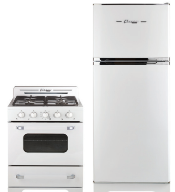
Match pair with Unique's UGP-30CR OF1 Retro battery ignition range